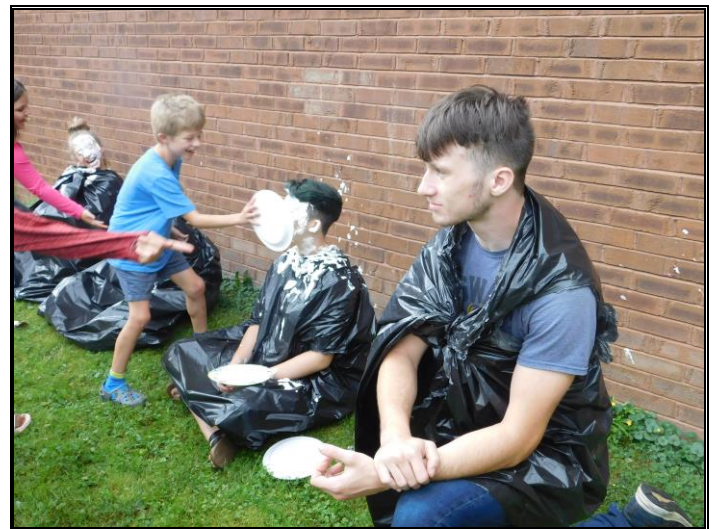
Kids tossed whip cream pies at Youth Group during last year's Rally Day event.

We will also celebrate our children that are moving up to a different Sunday school..