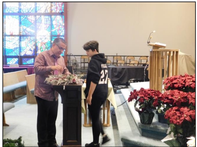
People were busy throughout the church to make FBC shine for the Advent season.

something very special about this time of year at First Baptist. From Advent candle-lighting to holiday music, to the Children's Pageant and Birthday Party for Jesus and our well-known traditional Christmas Eve service, FBC can be a serene and peaceful place to contemplate the season and its reason: Jesus Christ.