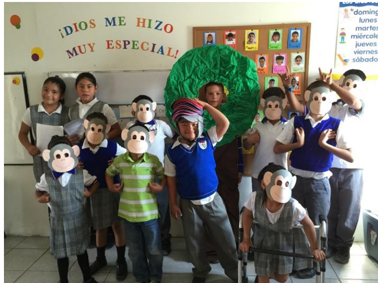
"Cuentacuentos" Day at the Monte Horeb School where some of Patti's students acted out "Se venden gorras" (Caps for Sale)

The day before was "Cuentacuentos" Day at the Monte Horeb School where the kids celebrated children's books.